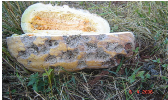
Picture 2: Hail stone damaged pumpkins at Emphondvweni under Ntandozi Inkhundla

Sorghum ears ( Picture 3 ) were seen mature and some already dry and ready for harvest in some parts of the Middleveld. Hail damaged pumpkins were found to be rotting as a consequence of the damage ( Picture 2 )