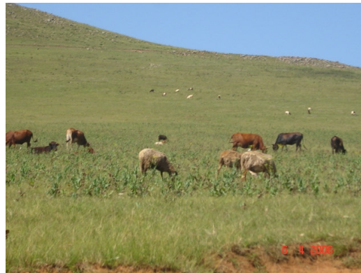
Picture 4: Cattle, Goats and Sheep grazing at Nsangwini in the Shiselweni region

Livestock was found to be doing well in most parts and specifically in the middle Highveld, where pastures are in a very good state ( Picture 4 ).