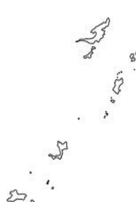
Fig 1 Rainfall Stations

The month of May was mostly warm and dry. On occasions, weather conditions became cloudy and breezy with a few shallow showers. In addition, visibility was reduced due to Saharan dust intrusion. Total rainfall for the month of May 2020 at the Argyle International Airport (A.I.A) was 22.6 mm (0.89 inches) , with \sim 7\% occurring in the first ten day, ~7% in the second ten days and ~86% in the last eleven days. There were 3 rain-days (rainfall greater than 1 mm) with the highest 1 day total being 17.3 mm on the 29th.