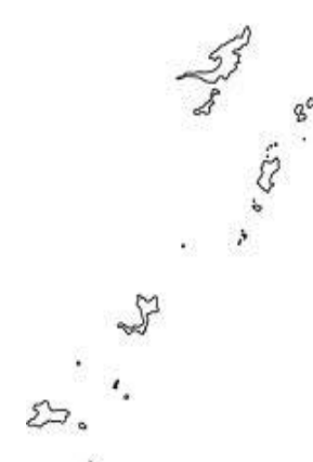
Fig 1. Rainfall Stations

Fair to occasionally cloudy skies observed across Saint were Vincent and the Grenadines for the month of April. Weak instability resulted in a few light to moderate showers, bringing temporary relief from the dry, hot days and nights. Total monthly recorded rainfall at the Argyle International Airport (A.I.A) was 39.0 mm (1.53) inches). There were 11 rain days, i.e., rainfall total being greater than 1.0 mm, and 19 dry days, i.e., rainfall total being less than 1.0m, 11 of which were consecutive days (2<sup>nd</sup>-12<sup>th</sup>). Island- wide, the highest monthly rainfall total was 218.3 mm (~8.59inches), and was