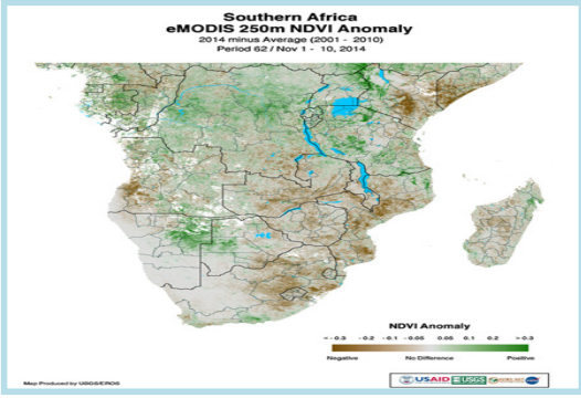
Figure 1: Vegetation Condition over Southern Africa

The vegetation difference from long term average map for Southern Africa for the period 01<sup>t</sup> to 10 November 2014 shows that most parts of the region including Malawi are experiencing below average vegetation conditions (Figure 1). As such, pastures are likely to be in poor condition.