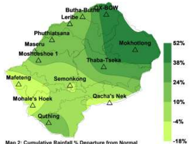
Map 2: Cumulative Rainfall % Departure from Normal

Despite plenty of rainfall received for the dekad, the cumulative rainfall since the first dekad of September remains normal in most places, while only a few places remain above normal. None of the places recorded below normal cumulative rainfall. Mokhotlong and Oxbow have the highest percentage at 49%, which is above normal, while Mohale’s Hoek has the smallest cumulative departure at -16% which is in the normal range, as shown in Map 2.