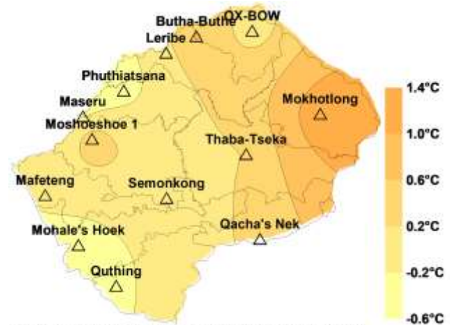
Map 3: Dekadal Mean Temperature Deviation from Normal

Most parts of the country recorded normal mean temperature deviation from normal for the dekad. The only place with above normal temperature deviation is Mokhotlong, with 1.3°C as shown in Map 3.