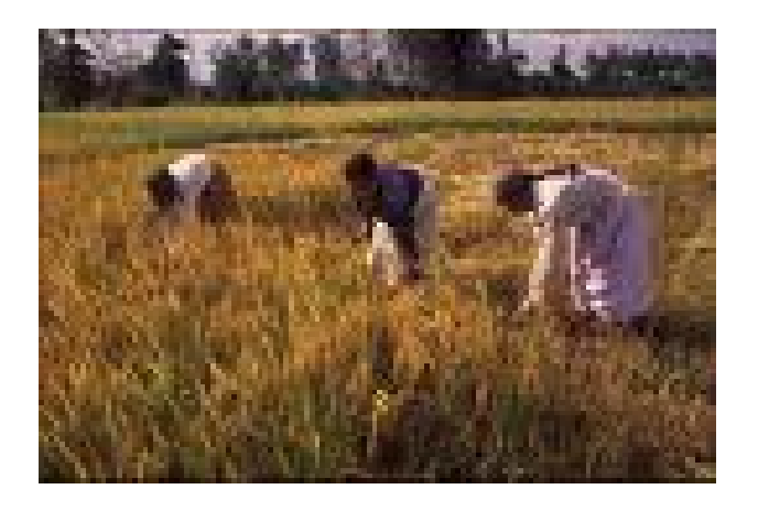
Issued by National Agrometeorological Advisory Service Centre Agricultural Meteorology Division India Meteorological Department Shivajinagar Pune.