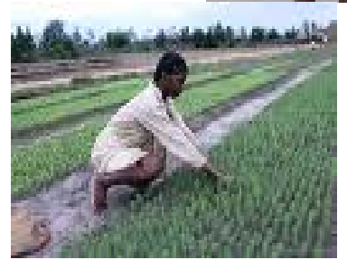
Issued by National Agrometeorological Advisory Service Centre Agricultural Meteorology Division India Meteorological Department Shivajinagar Pune